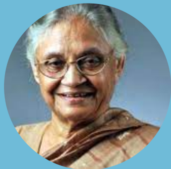
Sheila Dikshit Indian Politician