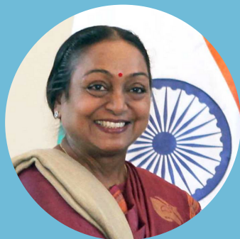
Meira Kumar Indian Politician