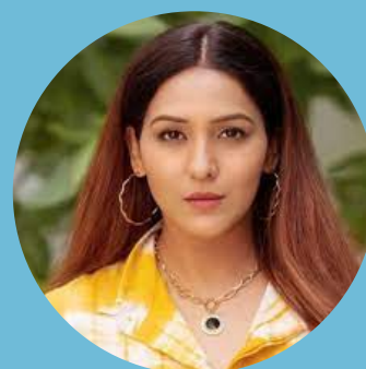
Neeti Mohan Singer