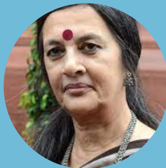
Brinda Karat Indian Politician