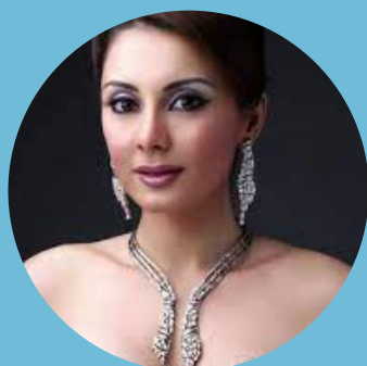
Minissha Lamba Actress