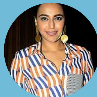
Swara Bhaskar Actress