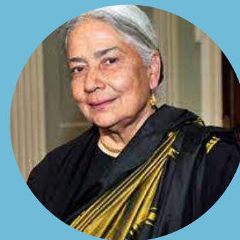
Anita Desai Novelist & Professor at MIT