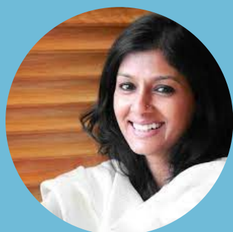
Nandita Das Actress and Director