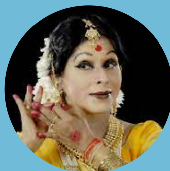
Shovana Narayan Kathak Dancer