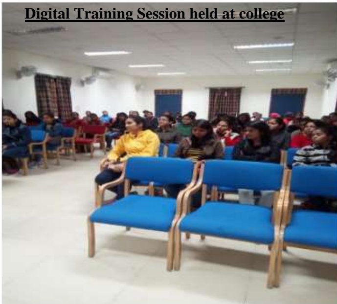
Digital Training Session held at college