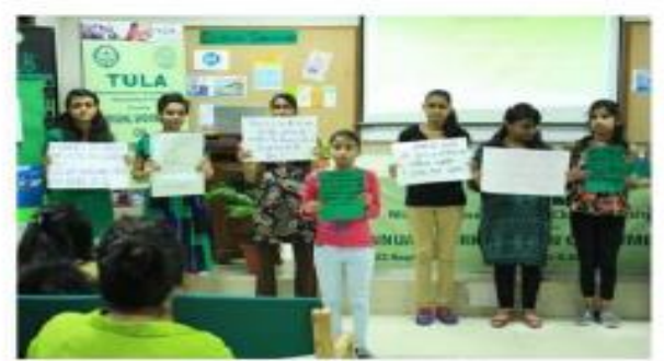
Flash Mob organised during workshop

Glimpses from the Annual workshop 2016, which is conducted by TULA for Consumer Education, Awareness and Protection every year