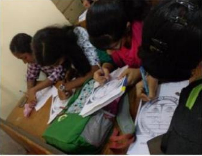
Orientation for new academic batch 2016-17